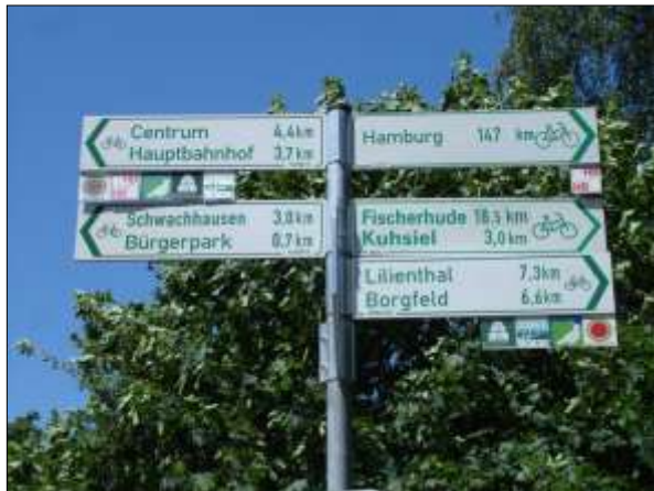
Long distance cycle route HH – HB signposting in Bremen