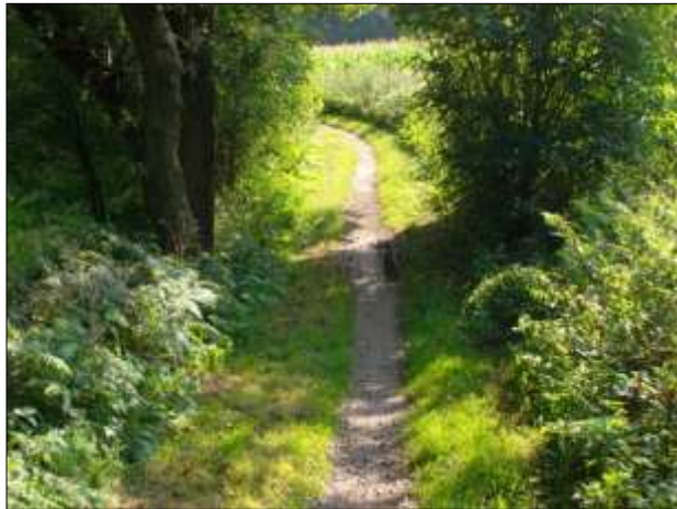
Small path in a nature reservat

- short sections with bad quality of width and surface (Hamburg – Bremen)