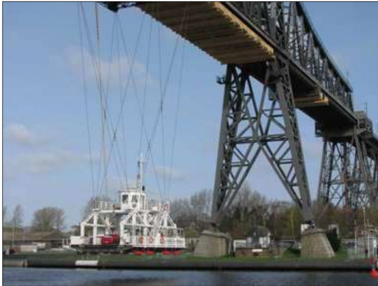
Ferry across the North- Baltic Sea Canal

Only less attraction (highlights to theme pilgrims – St. James) – but other one!