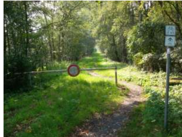
Not allowed way for cyclists!?

This project is co-financed by the European Union under the preparatory action "Sustainable Tourism".