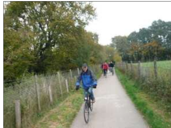
Cycle way in the region of Münster

This project is co-financed by the European Union under the preparatory action "Sustainable Tourism".