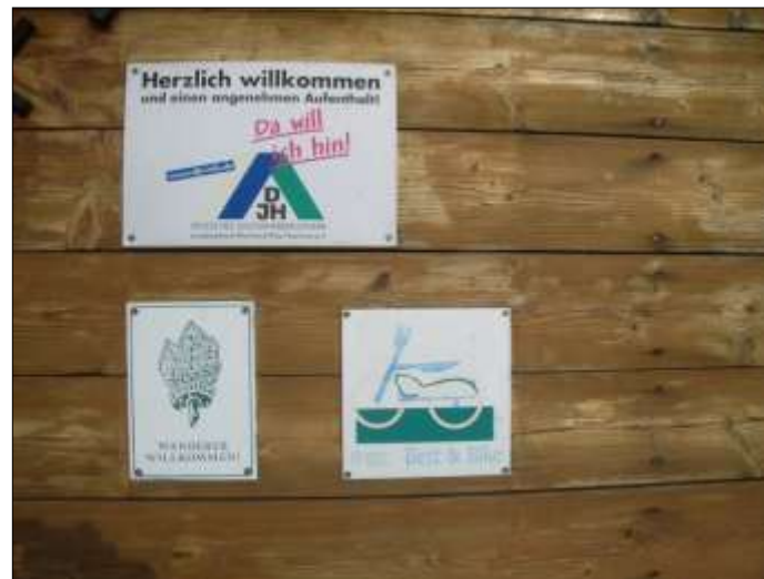
Youth hostel – bed+bike member

This project is co-financed by the European Union under the preparatory action "Sustainable Tourism".