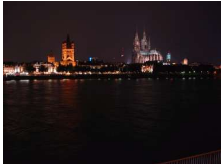
Cathedral of Cologne at night