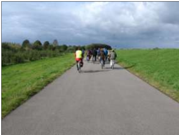
Cycle way near Xanten – Rhine-cycle route