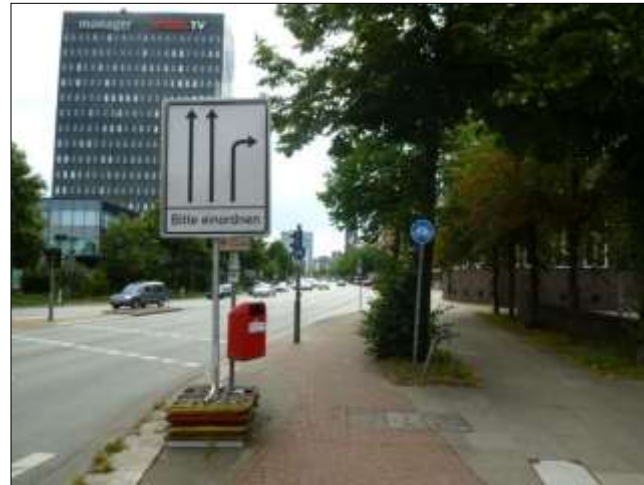
Cycle way Hamburg

This project is co-financed by the European Union under the preparatory action "Sustainable Tourism".