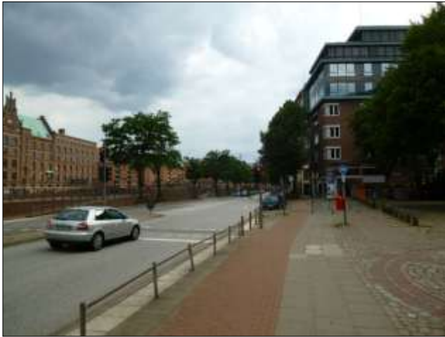
Hamburg – old warehouses