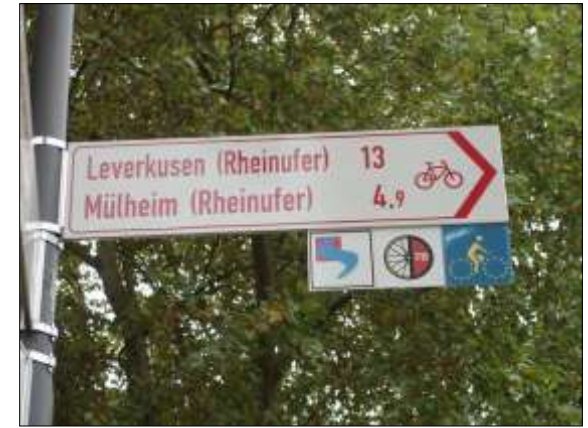
Long distance cycle route German network D-7 and D-8 in Cologne