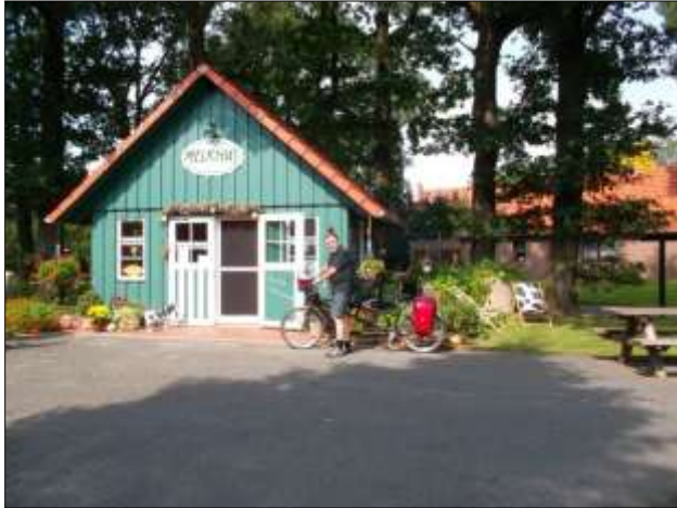
Rest station with milk products – „melkhus“